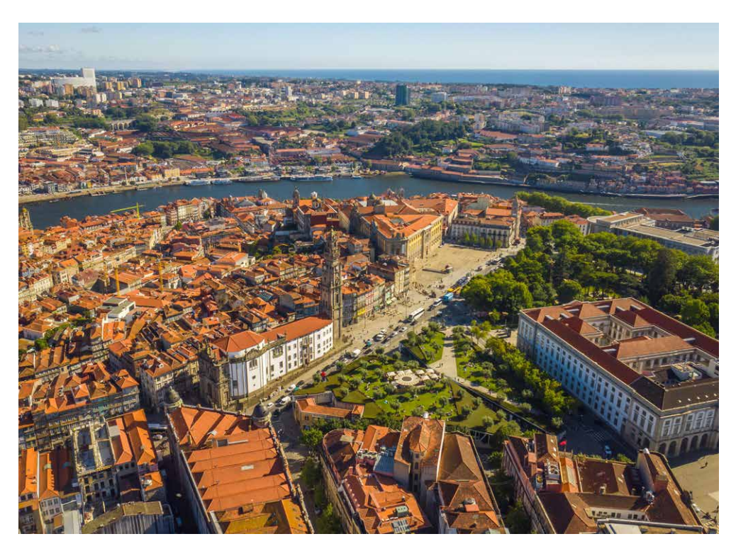
To know more about the initiative Greater Porto , visit the website: greaterporto.pt.

Considered one of Europe´s oldest destination, Porto should be a must add to your travel list. Get to enjoy the full spectrum of the city and you´ll not be disappointed. The perfect atmosphere to feel welcomed and comfortable wherever you are.